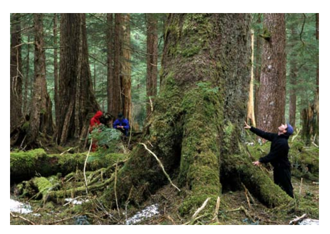
FIG 3 One of the last great riparian forests of West Baranof Province is still standing in Sitka's own backyard. The Indian River flood plain has a 480-acre patch of mapped large-tree forest growing on non-federal lands and Municipal Watershed LUDs. The Landmark Trees Project has measured spruces here up to 200 ft (61 m) tall and 74 in (188 cm) in diameter at 10 ft (3 m) above the ground.