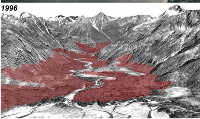
FIG 5 Above: Katlian River estuary. Photo by US Navy, 1929. The dark, coarse-textured, valley-bottom forest in center was a magnificent stand of Landmark-calibre big spruces. The Navy took many oblique shots like this one–often labelled "timber"—for the US Forest Service that was eager to build a logging economy in the region.

The Navy photographers had an eye for valuable trees. Their oblique photos were largely coastal, so virtually all of their "timber" shots were easily accessible to loggers. A search through the USFS collection in Juneau has failed to locate a single Navy "timber" scene where the coastal large-tree forest stands still exist today.