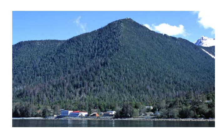
FIG 2 View east to the slopes of Sitka's Gavan Hill from Japonski Island. To the right of the dotted line, forest canopy texture is smooth; to the left, an older forest is coarsetextured. These aspect-related differences in forest structure are most prevalent in Southeast's most wind-exposed provinces such as West Baranof, South Prince of Wales, and Kupreanof-Mitkof. Here, the southerly, storm-exposed slopes are often covered with middle-aged "wind forests," while northerly lee slopes retain ancient, uneven-aged old growth that has not seen stand-replacing disturbance for millennia. A century or two ago, a major storm blew down most of the south-facing forests on this hillside.

Forest types, historical logging, and roads are mapped within the West Baranof Province in Figure 6. Refer to the Arc Reader GIS database in Appendix C of this report to review detailed mapped information on location of large-tree stands, past timber harvest, roads, forest reserves, protected areas, and regions of core ecological values.