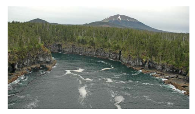
FIG 4 View northeast to Mount Edgecumbe over the andesitic lava cliffs of the outer Kruzof shoreline. Heavy seas pound almost perpetually against Cape Edgecumbe, one of the most exposed points in Southeast. The southern, volcanic portion of Kruzof Island feels in some ways a world apart from "typical" Southeast terrestrial and coastal habitats. Virtually no large trees grow here, and even modestly productive forest is thinly dispersed on the ash-blanketed and wind-lashed flanks of the volcano.

Volcanic activity began on Kruzof about 600,000 years ago. At the ending of the great ice age, between 12,000 and 14,000 years ago, a series of major explosive eruptions spread ash over much of Southeast. (Riehle 1996)