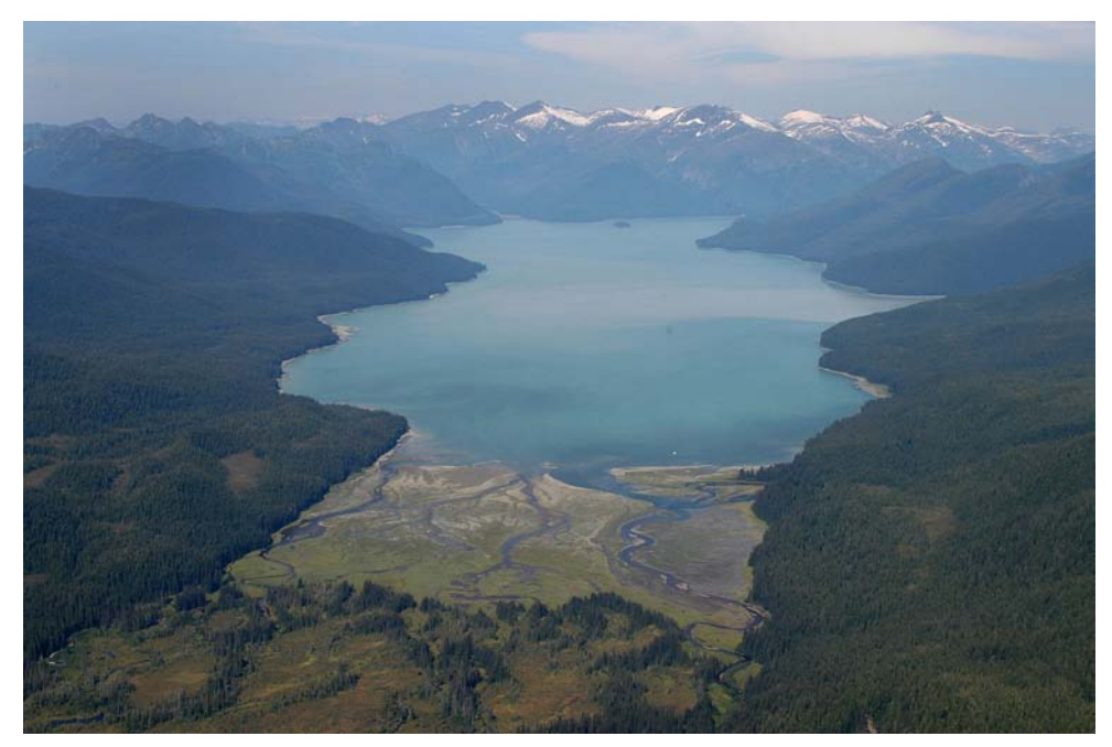
FIG 1. Gilbert Bay on the mainland south of Juneau. Additional protection for large intact watersheds is the key to an effective conservation strategy in southeastern Alaska.

Today, conservationists and resource managers have an extraordinary opportunity